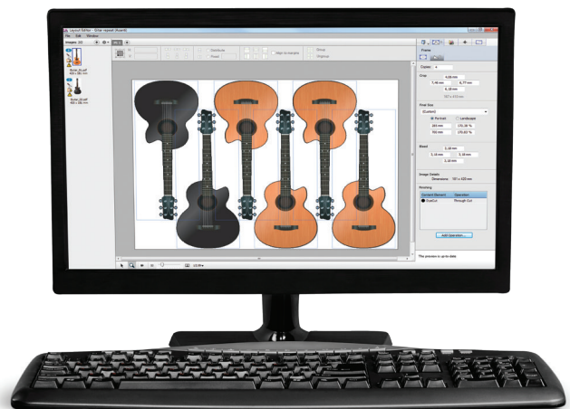
IMAGE NESTING SCREEN

IntelliTune automatically analyzes and improves image quality. It eliminates noise, bitmapping and blurriness — and also optimizes skin tones.